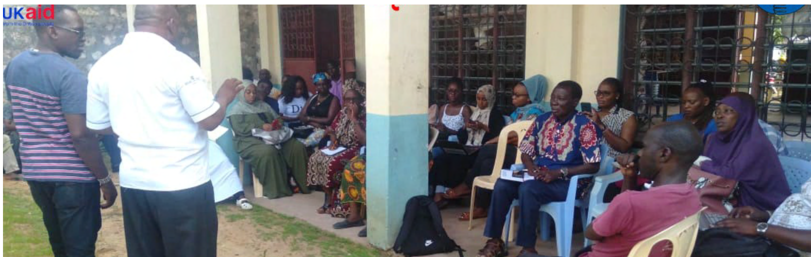
Interface meeting between the hospital management and some community representatives on the score-card

To ensure the effectiveness and efficiency of service delivery within Kilifi County and, most specifically, at the Youth-friendly Centre, more effort has to be put into ensuring that key budgetary allocation at the Sub-County levels is informed by the agreed-upon action areas prioritised during the interface meeting. The support given to the Score Card committee resulted in institutionalising the youth-friendly service centre. The involvement of both the youth and county government officials was vital in ensuring that the Score Card achieved its intended objectives. This has led to the creation of a platform for both parties to engage effectively to improve the services delivered and accessed at the Centre.