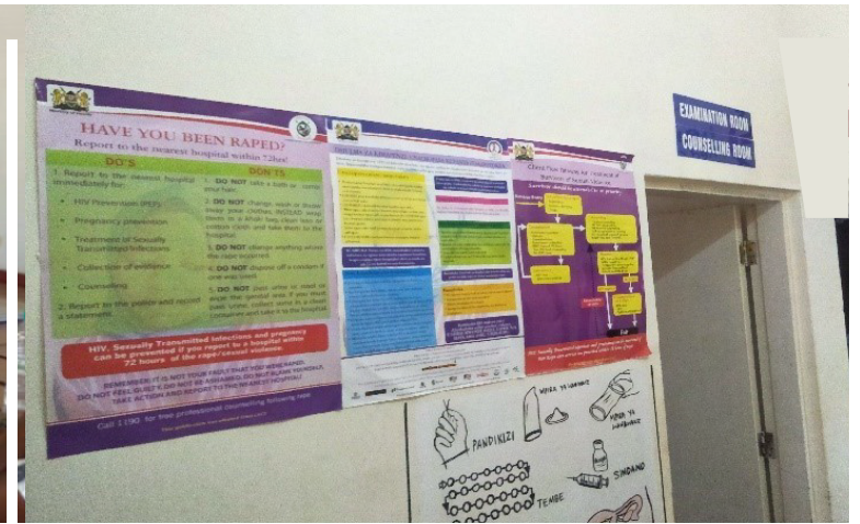
Notice board for the Youth-friendly Centre at Malindi Sub-county Hospital