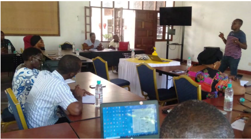
Training for the Score-card Committee

The young people of Malindi Sub-County and its environs are faced with multiple challenges in regard to health provision within the health facilities in the Sub-County. One of the critical problems is poverty and cultural beliefs, which have affected how young people perceive and access reproductive healthcare services. This has greatly impacted most young women/teenage girls within the Sub-County, especially when faced with early pregnancies. Malindi Sub-County boasts of a referral Sub-County Hospital that serves the populations of Kilifi, Tana River and Lamu Counties. However, the hospital has its fair share of challenges, such as the unavailability of medical resources and space to provide much-needed youth-friendly services. Another pressing challenge is the inadequacy of trained clinicians in the respective clinics at the Centre, which impacts the sharing of information and quality of Sexual and Reproductive Health (SRH) services being offered to the young people. Kilifi County has the most progressive and detailed reproductive health policy that addresses challenges facing young people. Still, minimal budgetary allocation towards building or equipping the Youth-friendly Service Centre within the Malindi Sub-County Hospital has affected the level and quality of services offered.