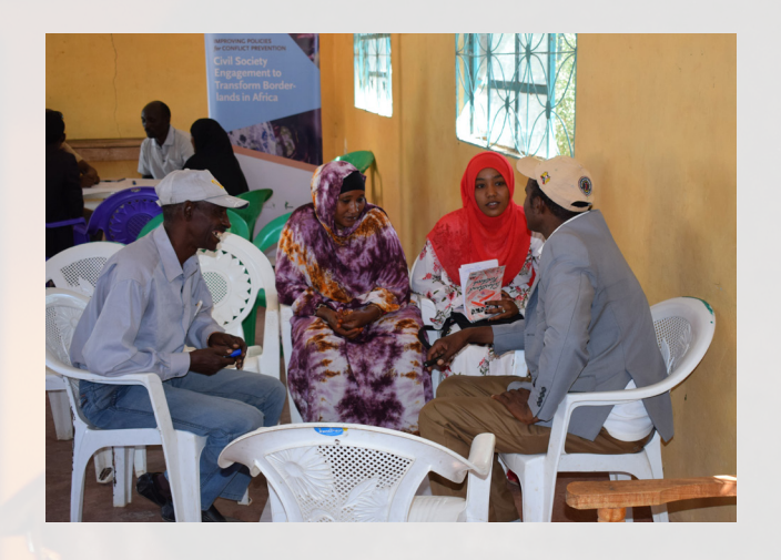
Cross-border collaboration coaition at the Busia -Uganda border