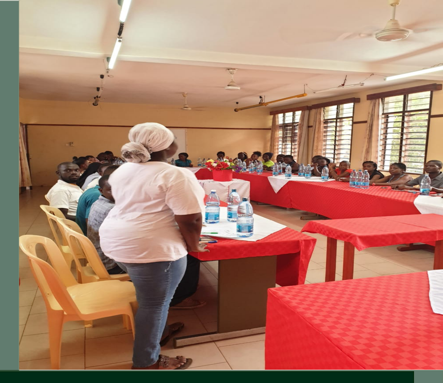
Youth Enterprise Development Fund conducting a youth training on entrepreneural and life skills.

The entrepreneurship training composed of the below key topics: