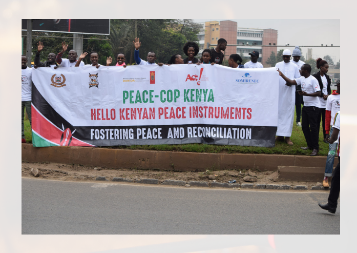
SOMINEREC Slum Peace Campaigm in Nairobi County