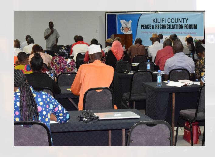
Kilifi County Commissioner addressing the audience at the Peace & Reconciliation forum