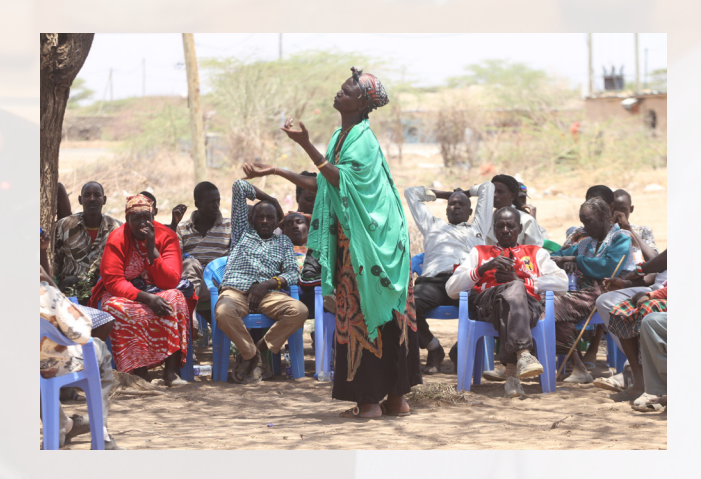
Peace Building and Conflict Transformation forum