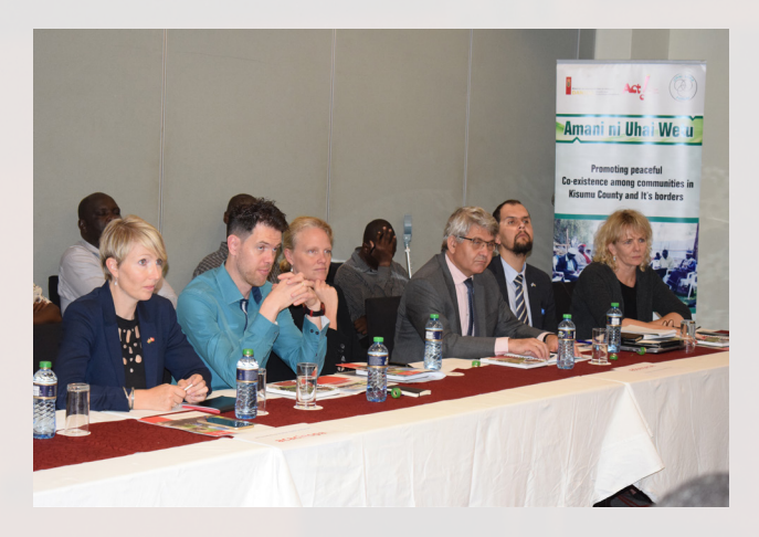
Mette Knudsen(Nordic ambassador) visit to Kisumu