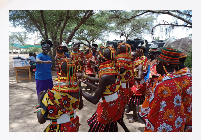
Graduation ceremony after a successful forum on Natural Resource Management for Tullow Oil Kenya.