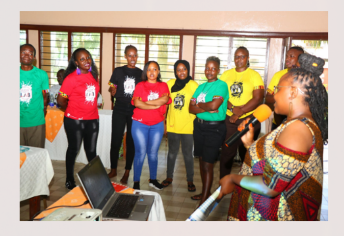
Human Rights Peace and Security Mentorship Program (12wks program) by HURIA