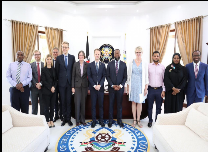
During the implementation of the Peace , Security and Stability 5 year program in Kenya to enhance efficiency and effectiveness of State and Non-State Actors funded by Embassy of Denmark in Kenya & Somalia