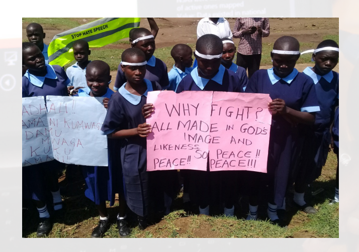
Pupils championing for peace