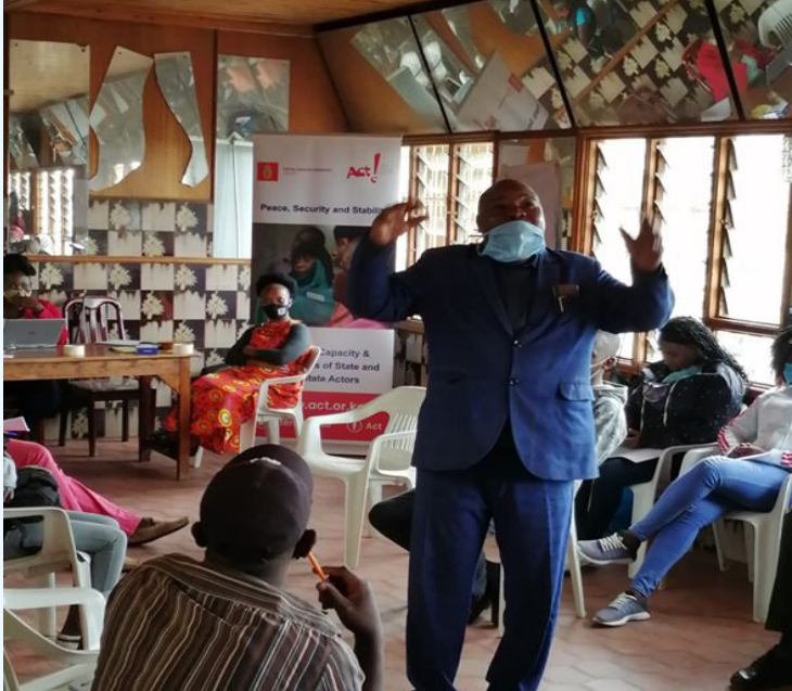
Area chief making his remarks during the peace forum

As part of fostering peaceful correlations, the discussions touched on the essence of landlord-tenants meetings for follow-up dialogues so as to keep track on the conflict resolution measures put in place and ensure peaceful coexistence within the community.