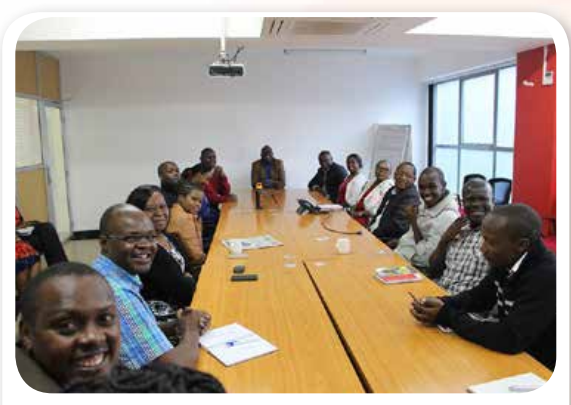
Act staff during a meeting with new Board Members