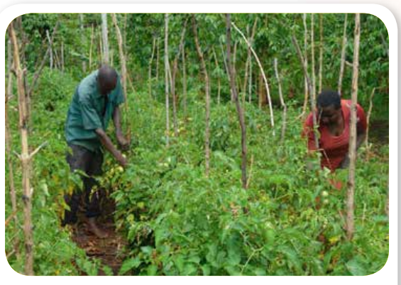
Farmers from Tharaka Nithi showcase their farm following training from GRADIF-Kenya on climate sensitive agriculture