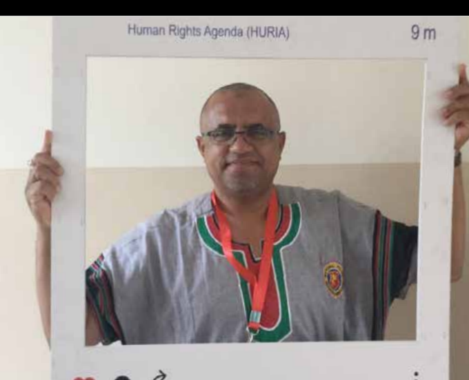
Commissioner Murshid Mohammed of the National Police Service Commission during the colloquium