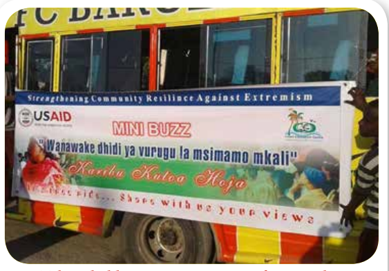
Taking bold conversations on Defying Violent Extremism to Kenya's public transport sector. The initiative dubbed Women Against Violent Extremism engages with members of the public to get insights on preventing radicalization in Coastal Kenya