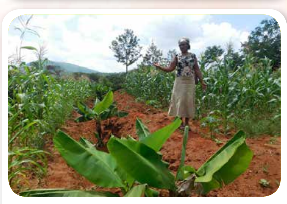
Monica Mutisya showcases part of her farm following training on mixed species farming. The farming model ensures farmers are food secure throughout the year