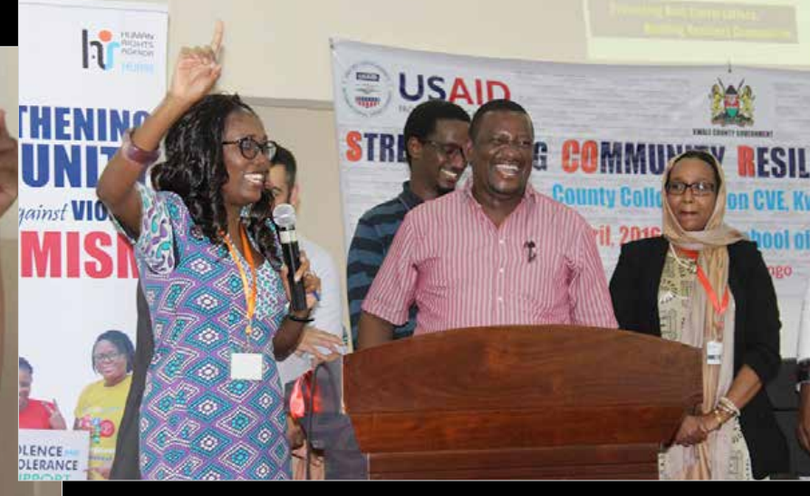
A delighted Kwale County Governor Hon. Salim Mvurya after officially opening the conference on CVE