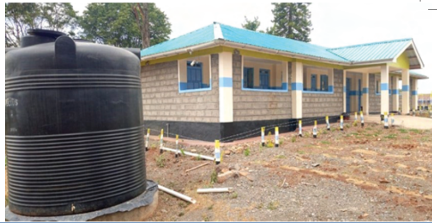
Before and after pictures of Ngobit health facility