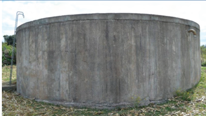
Kiandege Water Project Main Tank