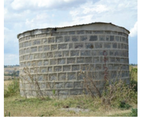
Community supply tanks for the Kiandege Water Project