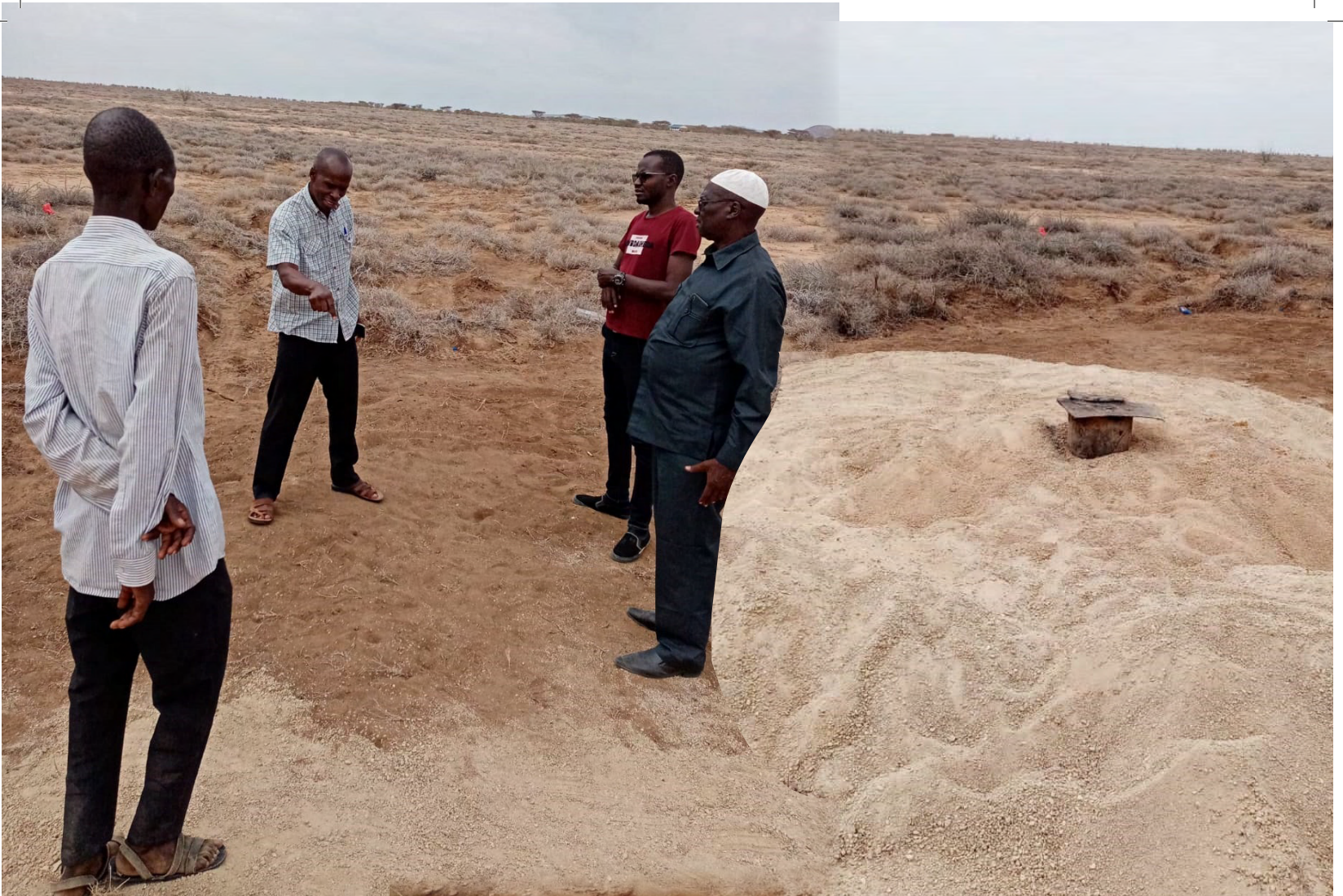
Site visit by the KDP Output 3 Technical at Kobuin, where the borehole was drilled